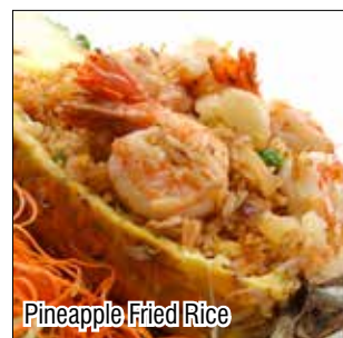
Pineapple Fried Rice