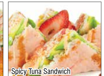
Spicy Tuna Sandwich