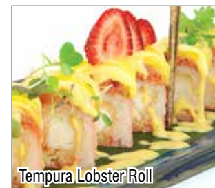
Tempura Lobster Roll