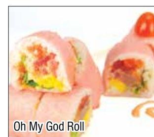
Oh My God Roll