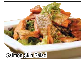
Salmon Skin Salad