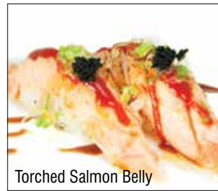
Torched Salmon Belly