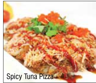
Spicy Tuna Pizza