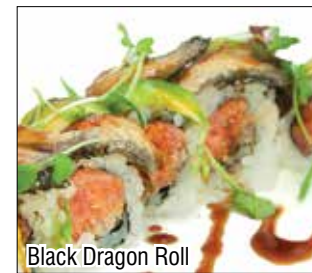
Black Dragon Roll